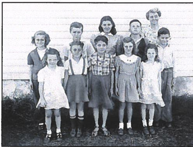
Early class of students at Moore School